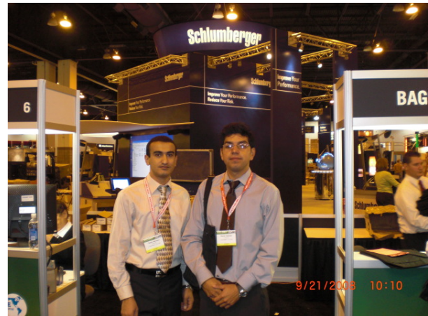
CSULB SPE Officers at ATCE Expo