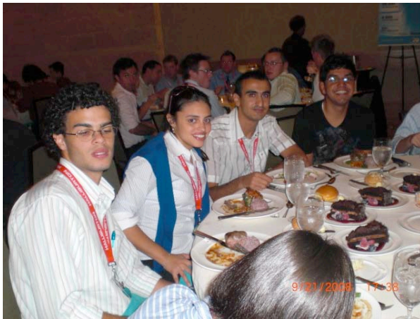
Student Dinner and Speaker at Hyatt Hotel