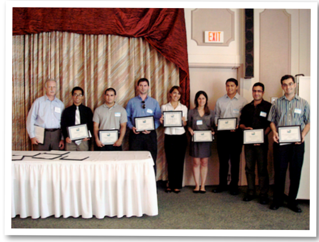
College Scholarships presented to the lucky recipients. A total of 16 scholarships were awarded in 2011.